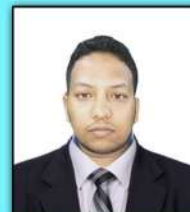
BOARD OF DIRECTOR