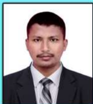
BOARD OF DIRECTOR